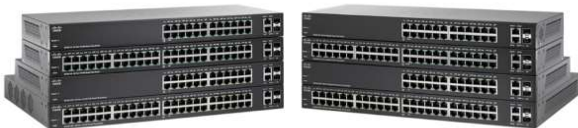
Figure 1. Cisco 220 Series Smart Switches

For businesses requiring high performance, security, and manageability from network switches, fully managed switches are an excellent choice. However, they typically come with high price tags. Smart switches provide the right level of network features and capabilities for growing businesses at lower prices, so you have more dollars to invest where they're most needed.